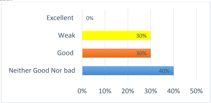
Figure 1- Performance of the students.